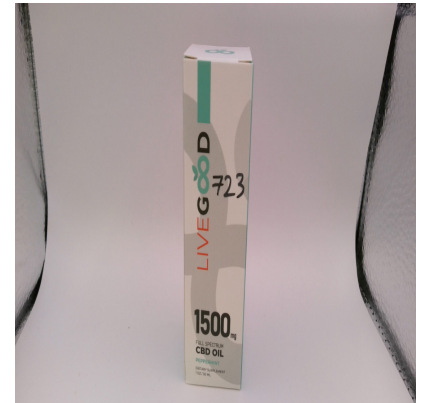
SERVING MASS (g): 30.0 SERVINGS/UNIT: 1

Deviations from standard operating procedure: None